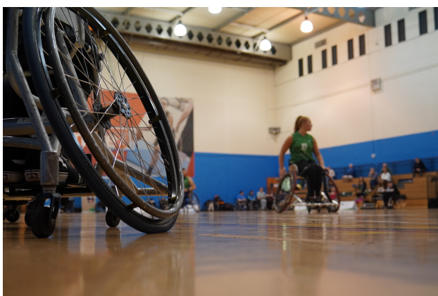
Home Nations Wheelchair Basketball Competition 2025