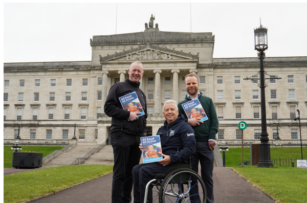
All Equal All Active Campaign