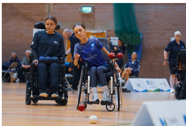
UK Boccia Championships 2025